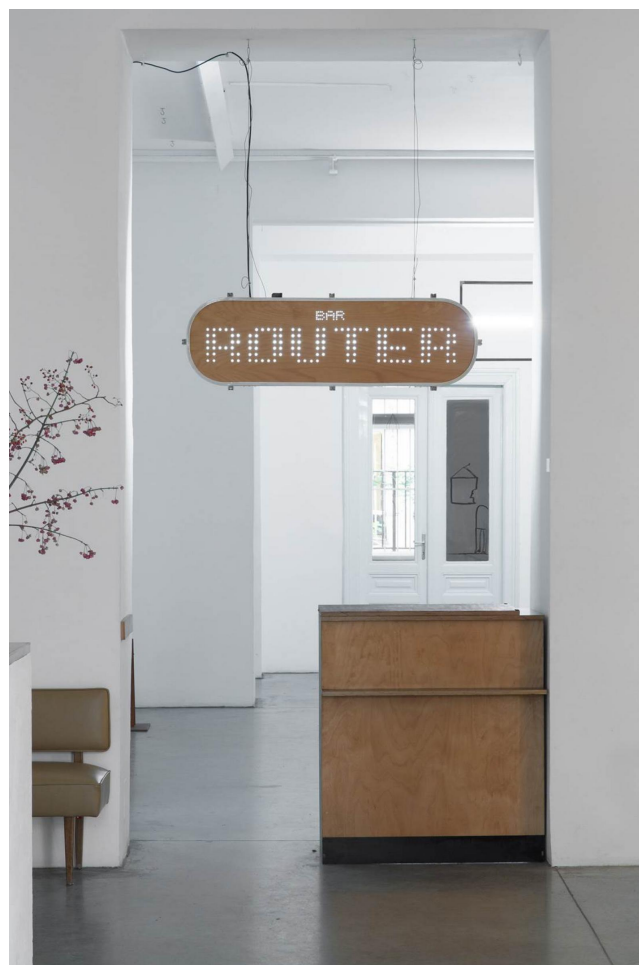
Relational Changes. curated by Cointemporary. Vienna 2015