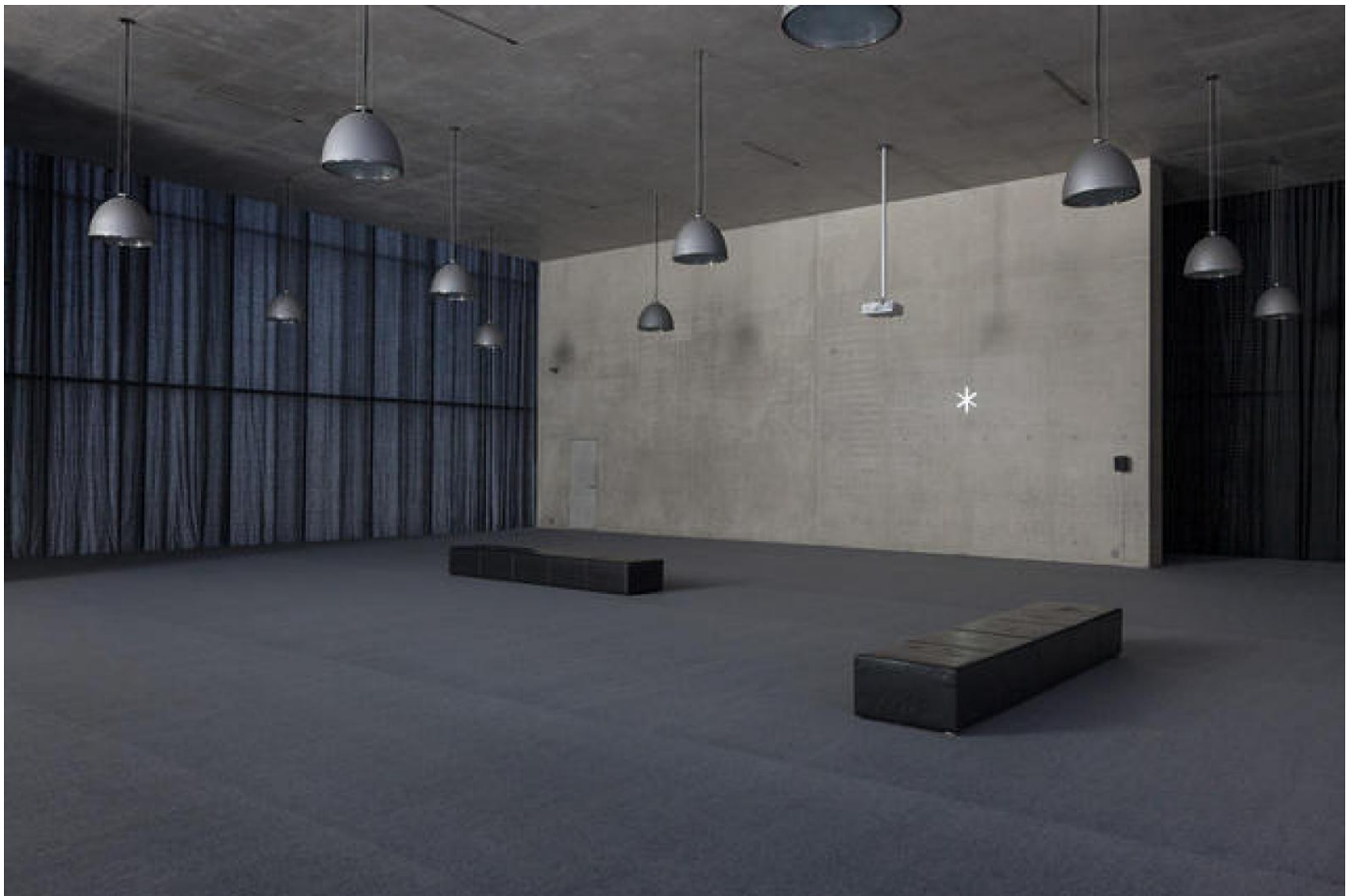
Dexter Sinister, At 1.1 Scale, 2015 Installation view "The * of love," Galerie Martin Janda, Vienna 2015

COMMERCE WAS POSSIBLE WITHOUT THE PRYING EYES OF THE PUBLIC, UNLIKE THE OSTENTATIOUS SPENDING DONE AT ART FAIRS.