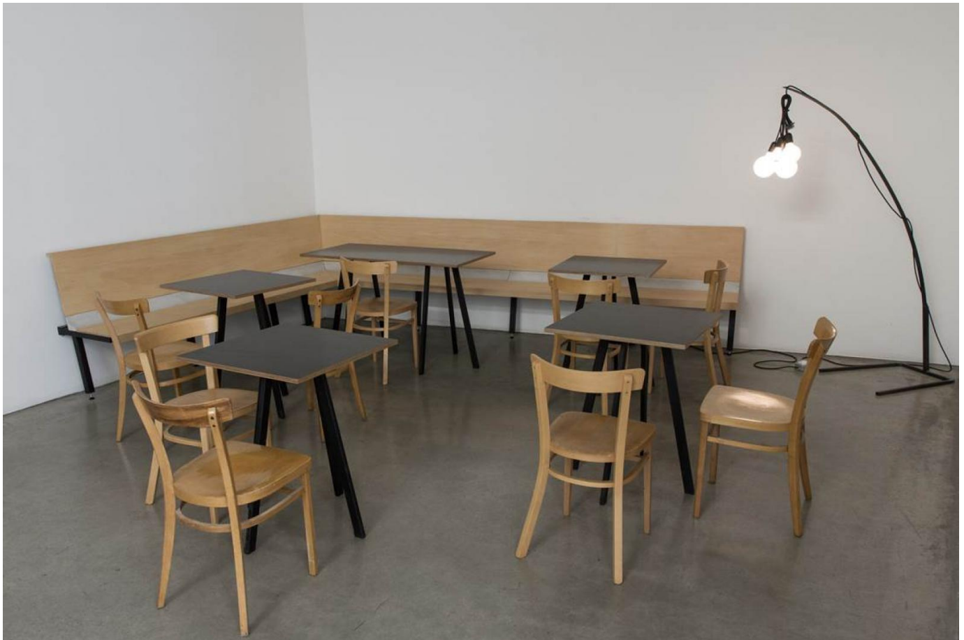
Relational Changes, curated by_ Cointemporary, Vienna 2015

From the get-go an overt antipathy towards capitalism was palpably felt here and in other exhibitions in the series. Capitalism is what keeps the galleries and museums open and I've yet to see anyone come up with a better alternative other than plain barter. So what could break the back of such a fiduciary juggernaut? Bitcoin, that dubious boogeyman "money," has found its way into the milieu of contemporary art as a new cultural signifier.