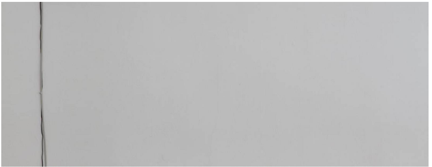
Relational Changes, curated by_ Cointemporary, Vienna 2015