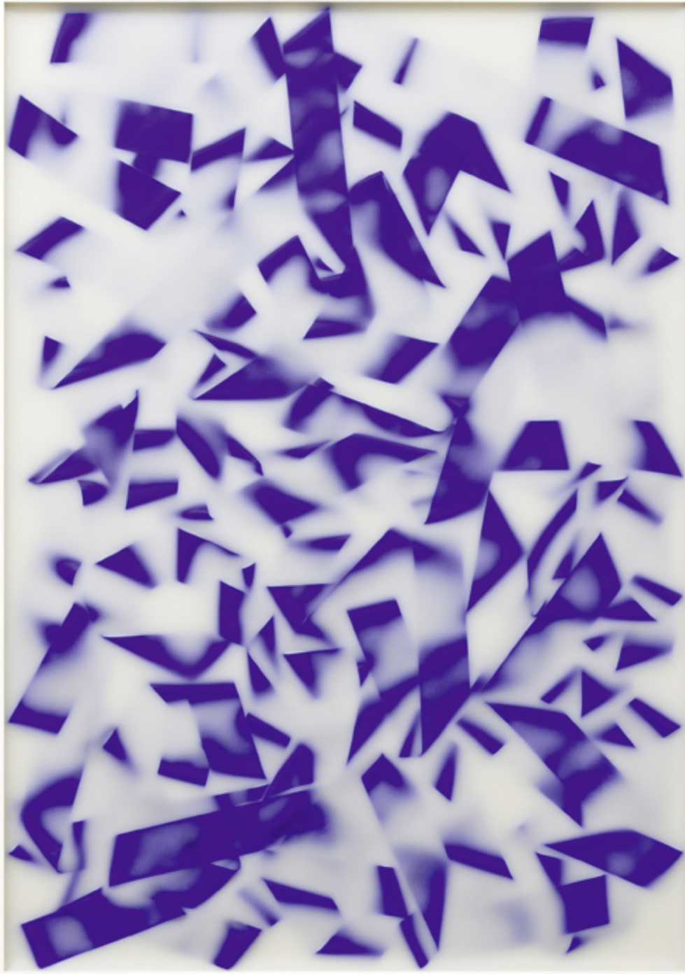
Untitled (Blue)_, 2012, Gymnastic ribbon wax and wooden frame

indicating the image object's empty frame in Adobe Creative Suite. This work was shown alongside eight others in the artist's 21er Raum presentation at Vienna's 21er Haus in 2012, collectively titled Überfläche – a play on the German word for 'surface'.