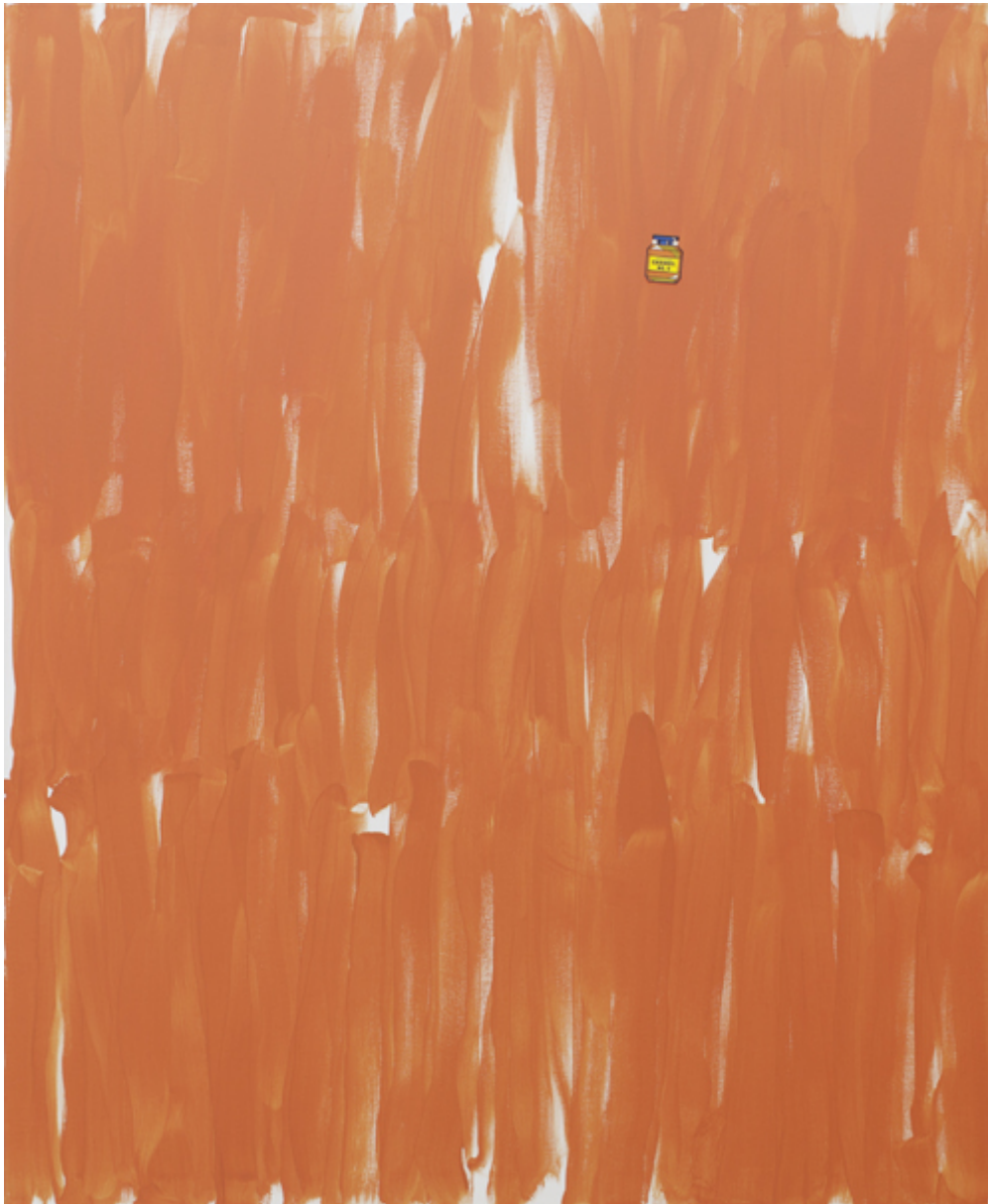
Channel No. 5 , 2012, acrylic paint and sticker on canvas

Boot also makes works which seem coincidental, their category as objects precarious or accidental. His series of paintings, including e who remained was M (2012), comprises the traces left by shell pasta steeped in watercolour and casually cast onto unstretched canvas, linen or paper. But the poetics of pliant wet pasta are most clearly shown in his wall-based works Untitled (Black) , Untitled (Navy Blue) and Untitled (Pink) (all 2012), which see loose folds of pigmented gymnastic ribbon suspended in baths of milky wax. For these, the surface captures a strand of material lengthier and more dynamic than itself: flexibility and locomotion fixed within the standardizing format of the canvas.