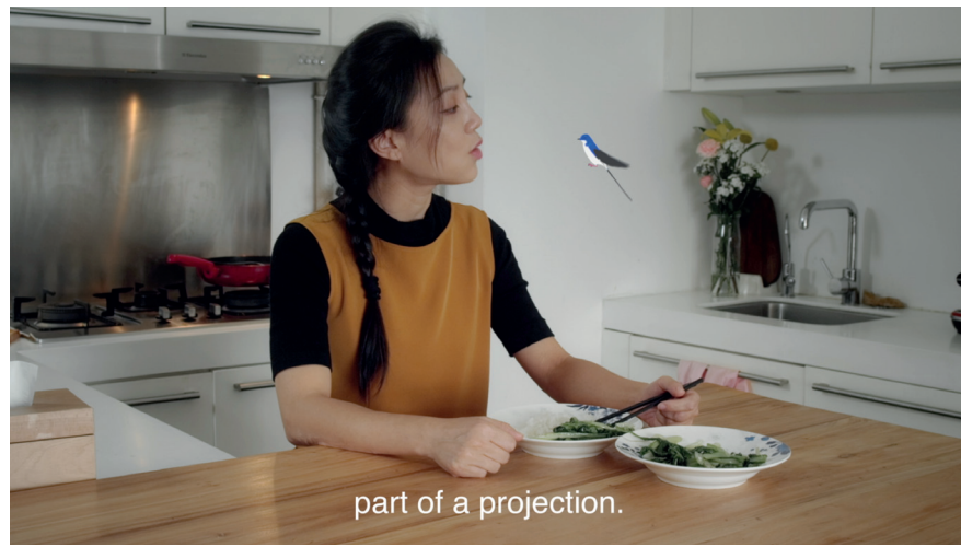
part of a projection.

centre. The solarium is full of birds incinerated by the solar panels on the roof and all of the honeybees are mysteriously dead. Holed up in his office – it never occurred to him to leave – Amos talks to the Weather, a disembodied voice that chastises him for his love of control. ‘It’s not wrong to want for clean lines, cantilevers and gravity-defying streams of movement,’ it tells him, but not if that comes ‘at the expense of other people’s lives’. Amos sighs and says the Weather is missing the point. ‘The building was never about these people.’