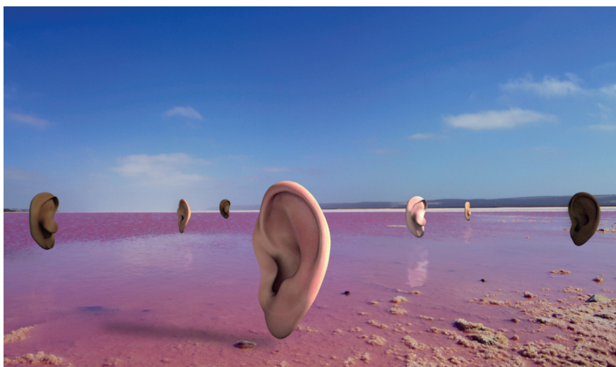
ABOVE Sprung a Leak, 2017, video still