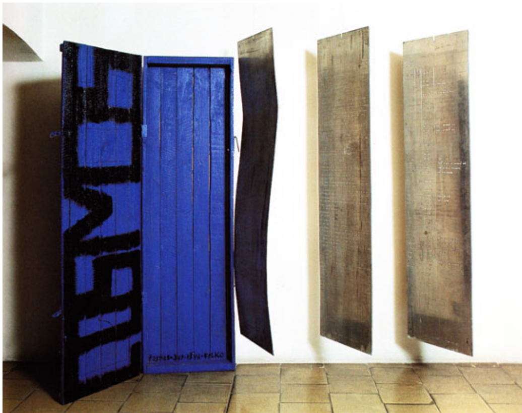
Stano Filko, Let na mesiac a späť, otvorená inštalácia (Flight to the Moon and Back, Open Installation) , 1970.

In this respect, an appreciative reading of Filko's practice can open a pathway to understanding that the legacy of the 1960s does not necessarily lie in the imposition of an exclusive either/or choice against/for metaphysics/pragmatism. Filko's work, on the contrary, challenges us to grasp how the specific use of mundane materials and signs coexists with techniques of claiming totality within one practice, and how that practice acquires its critical edge (and power to sustain itself in the face of political oppression) by consummating