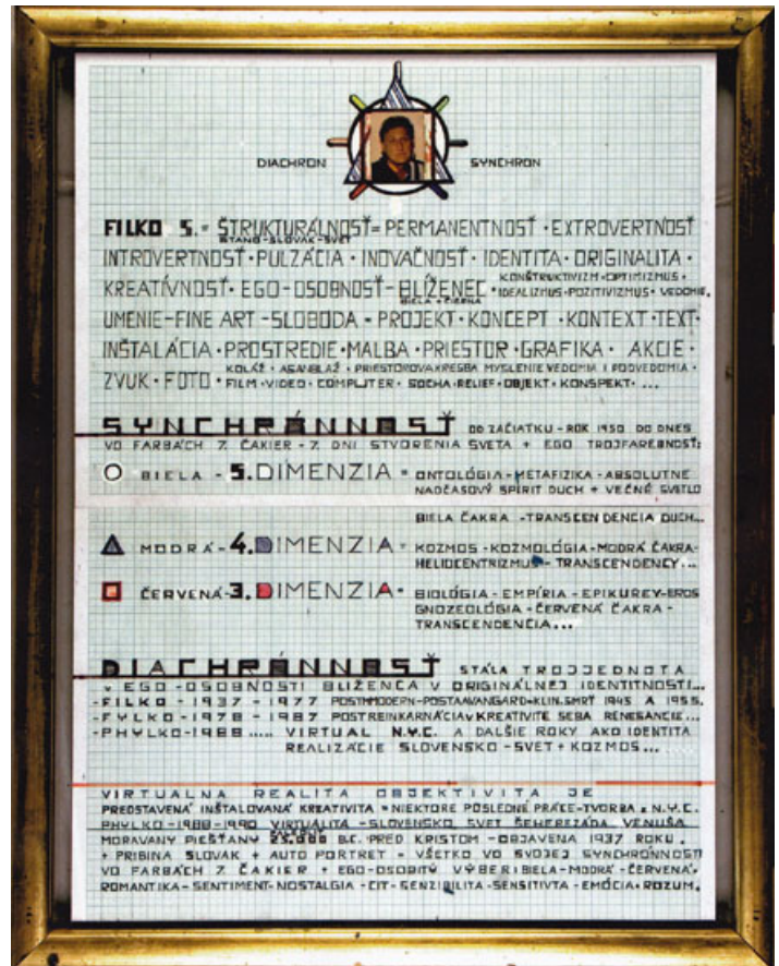
Stano Filko, Ego Diachron Synchron , c. 1990-99.

Going through the reverse helix of the dialectics, however, means that all that becomes conceptual is equally rendered material. So the absorption of life into the thought process is offset by a radical moment of self-othering. When Filko spells out his life in the sequence FILKO , FYLKO , PHYLKO , and PHYS , he also writes the self as other : every single one of his clones is equally a material manifestation of an alterity, when the self, upon entering new horizons of experience, comes to physically perceive itself as a total other to itself.