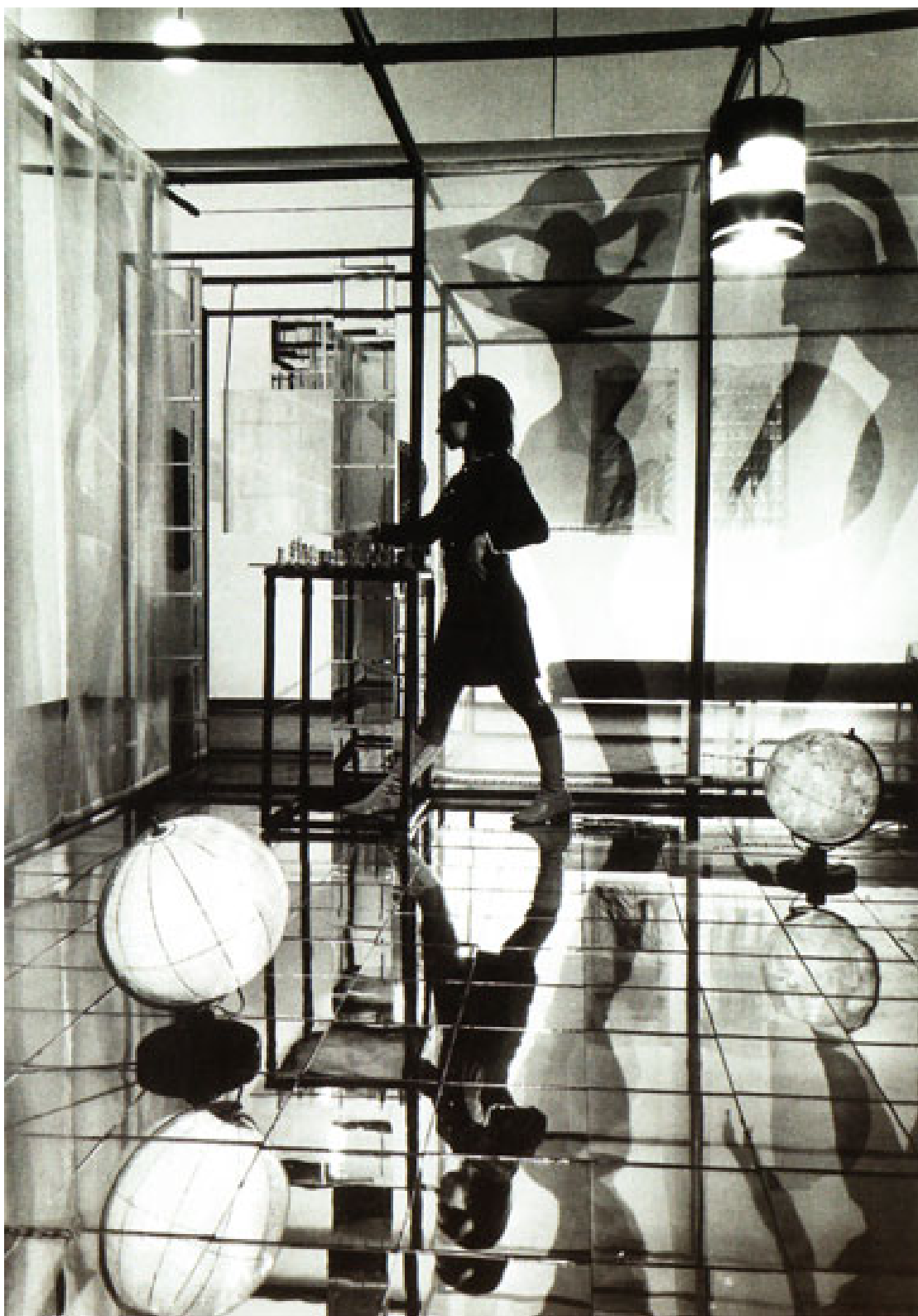
Stano Filko, Environment Univerzál (Environment Universal) , 1966-1967.