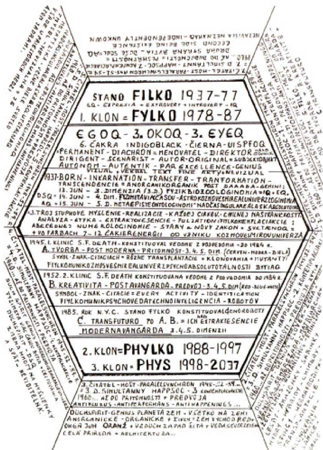
Stano Filko, Projekt myslenia - mentality (Project of Thinking - Mentality), c. 2000.