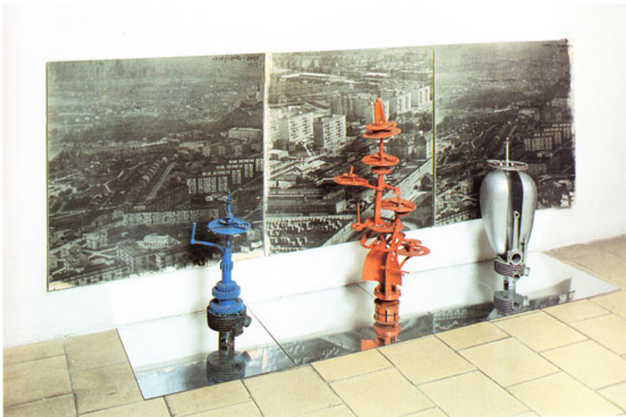
Stano Filko, Modely vyhlídkové veže-architektúra (Models of the Lookout Tower Architecture) , 1966–67. Environment.