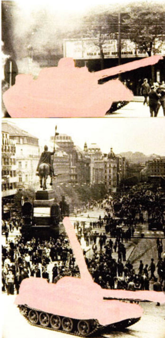
Stano Filko, Untitled , undated photograph.