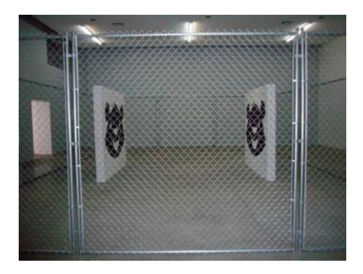
Kathryn Andrews, "Friends and Lovers," 2010, installation view.

A chain-link fence installed by Andrews closes off most of the gallery central floor space. Two white brick walls with caricatures of grinning cartoon bears painted on them stand in the middle of the fenced-off area. The caricatures face each other and seem completely self-contained. They have all the support they need, which means that, for viewers, circumventing the fence and heading to the back wall to see Mateo Tannatt's Monster Model: Blue Screen Version makes the most sense.