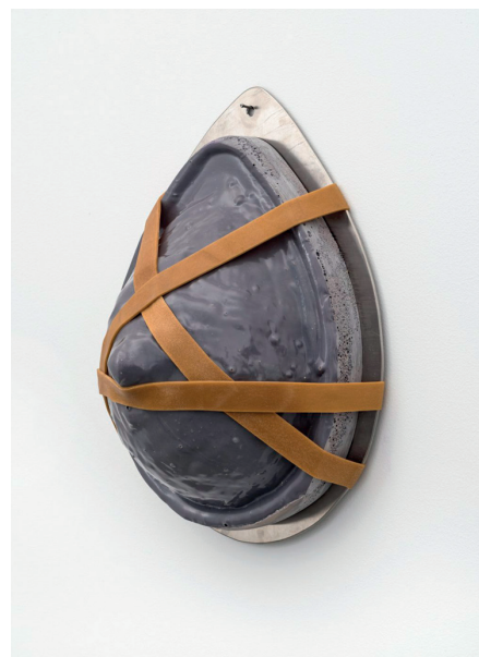
THIS PAGE BELOW Boob (detail), 2017, sand, resin, steel, dimensions variable.