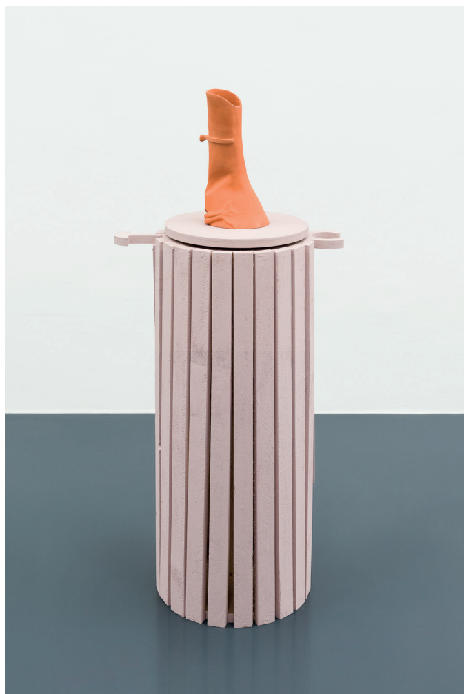
OPPOSITE PAGE 'Heartbreak Highway', 2016, installation views, Real Fine Arts, New York. Courtesy: the artist and Bortolami, New York; photograph: Joerg Lohse

The surrealist and mannerist histories in Henke's sculptures suggest a psychological treatment of architecture and space. Yet, if the bodies in this work are the repressed returning, they come back with a gently subversive attitude — for example, in the form of a lone female breast. Soft hills of sculpted-sand breasts were installed around