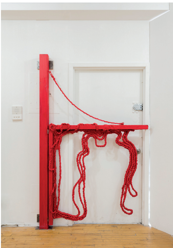
ABOVE City Lights ( Dead Horse Bay ), 2016, bronze and painted wood, 105 × 125 × 65 cm. Courtesy: the artist and Bortolami, New York; photograph: © Stefan Stark