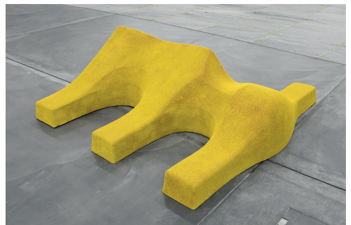
ALL IMAGES THIS SPREAD 'An Idea of Late German Sculpture; To the People of New York', 2018, exhibition views, Kunsthalle Zürich. Courtesy: the artist, Bortolami, New York, Galerie Emanuel Layr, Vienna/Rome, and Kunsthalle Zürich