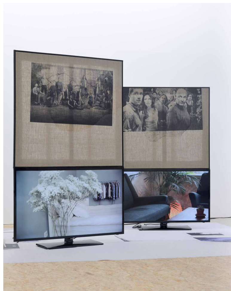
This page: "12346, not 5," 2013, exhibition view at Neue Alte Brücke, Frankfurt

I think that would be a work I showed at the annual exhibition at the Academy in Vienna. By definition it was still a student work, I guess. It was basically a text painting, saying "This is supposed to be the answer to the problem I just made up." I kind of liked that sentence but the work as a whole seemed lame—as in you could write that in neon and see it at an art fair kind of lame. Also the sentence was taken from some song text, I think. It was just too random in a lot of aspects. In the end I turned it 90° and projected the intro of the TV show "In Treatment" underneath. It was basically the setup I use for my sculptures now. My professor liked it and said she didn't know what it was or why, but that I should show it. ☺