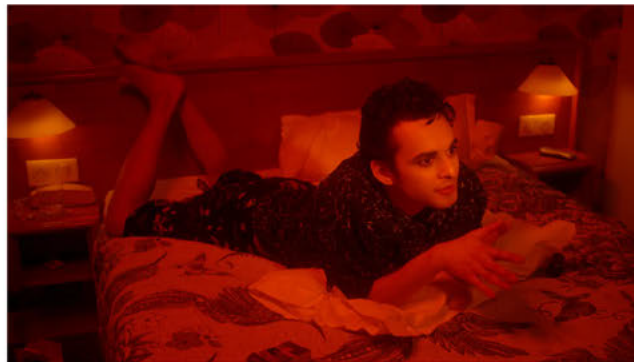
A still image from the video installation titled "I invited men into my hotel room and asked them very personal questions about their lives."