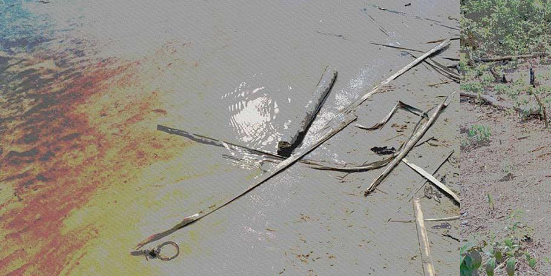
Julien Bismuth, Steganogram 30 (balsa) , 2017, digital image, dimensions variable. Courtesy: the artist and The Box, Los Angeles

p.p1 {margin: 0.0px 0.0px 0.0px 0.0px; font-size: 12px; font-weight: normal; font-family: sans-serif; line-height: 1.2; text-align: left; vertical-align: top; white-space: nowrap; width: 100%;} span.s1 {font-kerning: auto; font-size: 12px; font-weight: normal; font-family: sans-serif; line-height: 1.2; text-align: left; vertical-align: top; white-space: nowrap; width: 100%;} Julien Bismuth, Steganogram 30 (balsa) , 2017, digital image, dimensions variable. Courtesy: the artist and The Box, Los Angeles